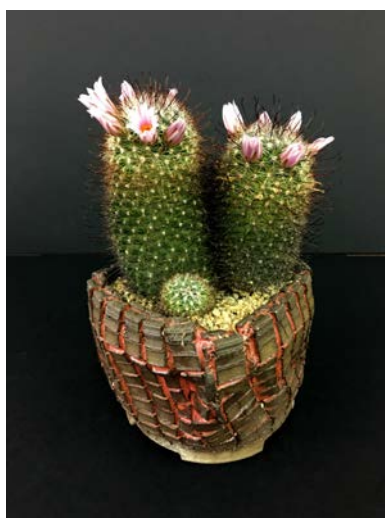
Mammalaria microcarpum