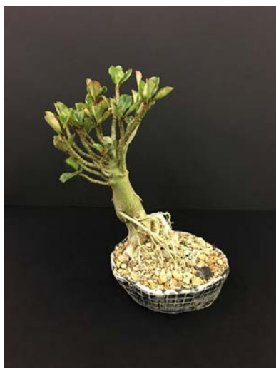
Adenium obesum - Stan Verkler