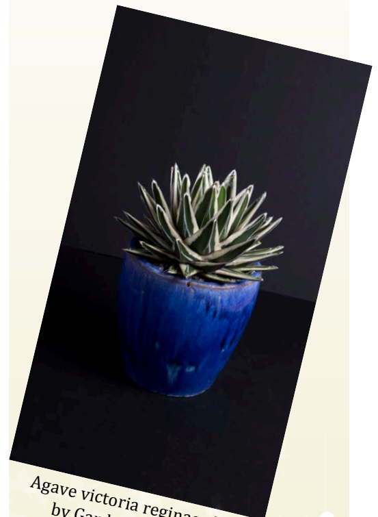
Agave victoriae-reginae alba by Gardener's Home