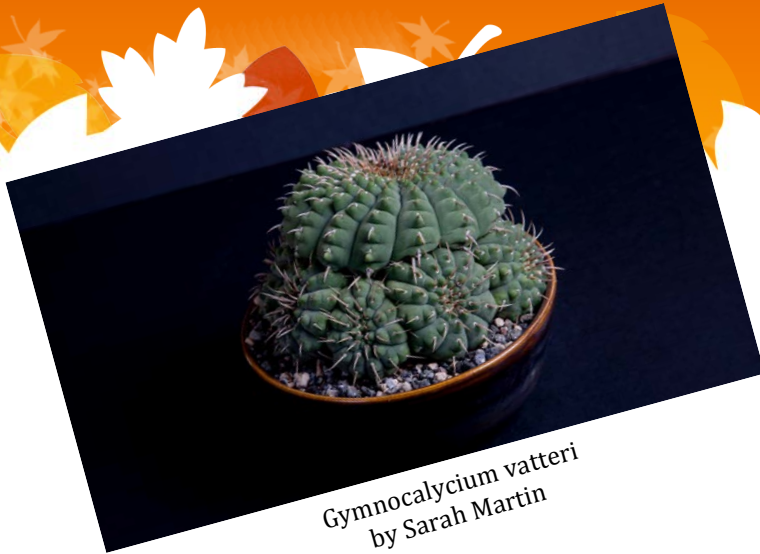
Gymnocalycium vatteri

Newsletter of the Monterey Bay Area Cactus & Succulent Society