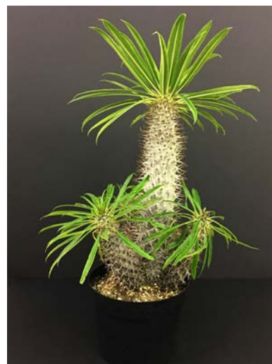
Pachypodium lamerei Pat Boylan