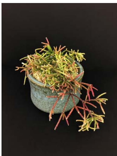
Rhipsalis pilocarpa Shirley Amadon