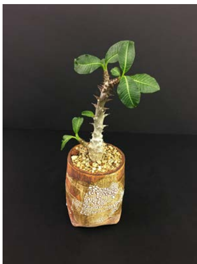
Pachypodium baronii v. windsori - Stan Verkler