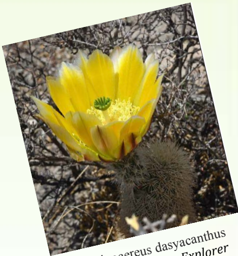
Echinocereus dasyacanthus From The Cactus Explorer