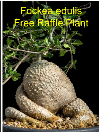
Fockea edulis Free Raffle Plant