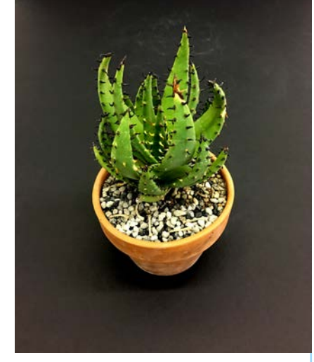
Aloe melanocantha