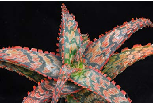
Aloe 'Jeff Karsner'