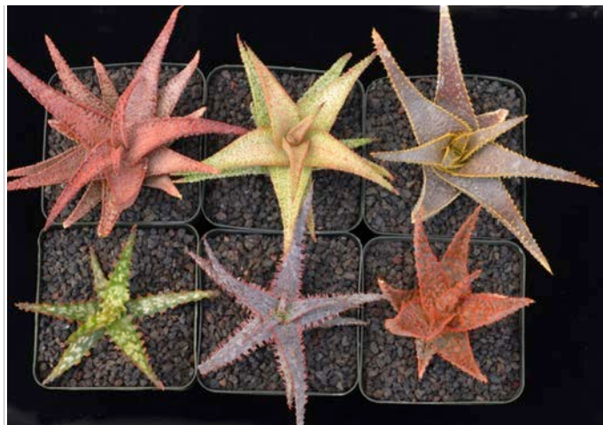
Bottom left: Aloe 'Gargoyle' Bottom right: Aloe 'DZ' Other plants: new hybrids under evaluation