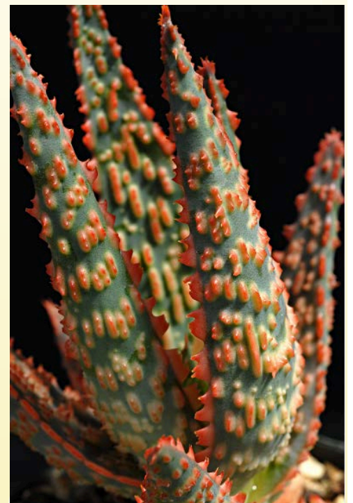
Aloe 'DZ' (Zimmerman)