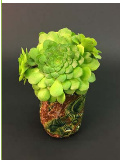
Aeonium arborescens Pat Boylan (Int. Succ. #1)