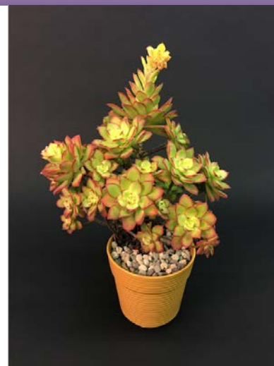
Aeonium 'Kiwi' Yolanda Borges (Novice Succ. #1)