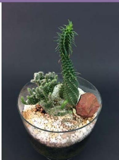
Dish Garden (tie) Bill Ashen