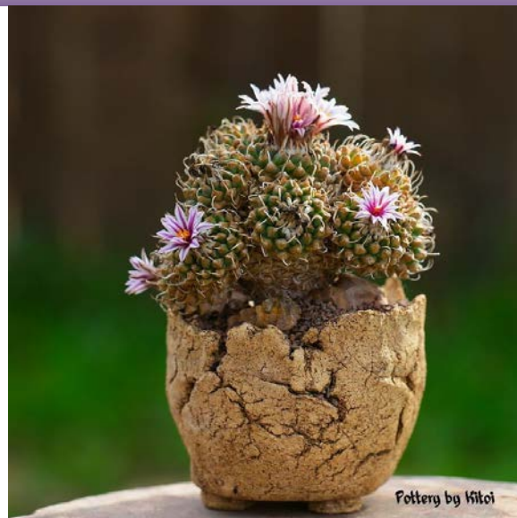
Example of Pottery by Kitoi

Monterey Bay Area Cactus & Succulent Society http://mbsucculent.org