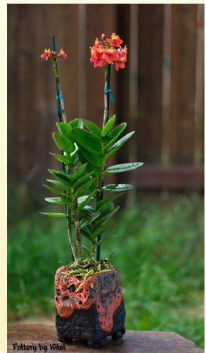
Pottery by Kitoi

Veterans of Foreign Wars, Post 1716 1960 Freedom Blvd. Watsonville, CA