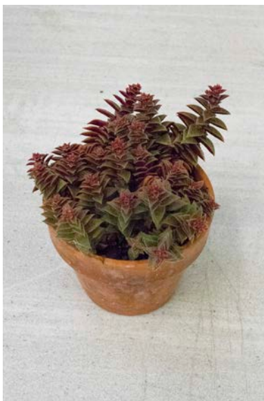
Crassula marnieriana Suzy Brooks Succulent Intermediate #1