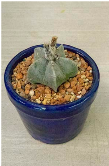
Astrophytum myriostigma Jemma Argabrite Cactus Novice #1