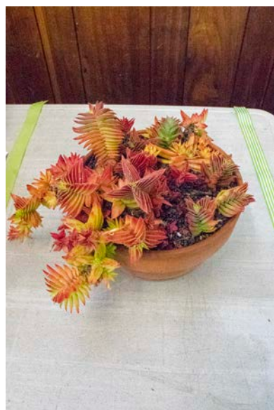
Crassula capitella Shirley Amadon Succulent Novice #1