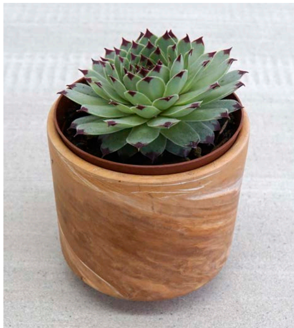
Sempervivum 'Gypsy' (aka 'Gypsy') Ellen Stubblefield