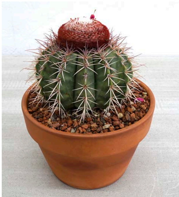
Melocactus sp. – Suzy Brooks