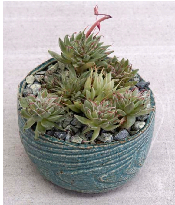
Sempervivum Pat Boylan