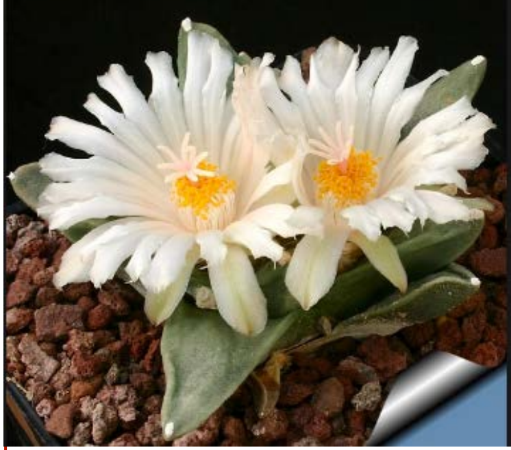
Ariocarpus retusus