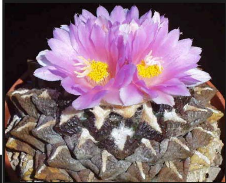
Ariocarpus fissuratus

I do not expect to take any sale plants to sell as I have almost only cactus and they do not sell very hot like near the ocean.