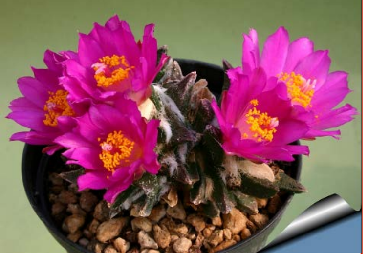
Ariocarpus scapharostrus