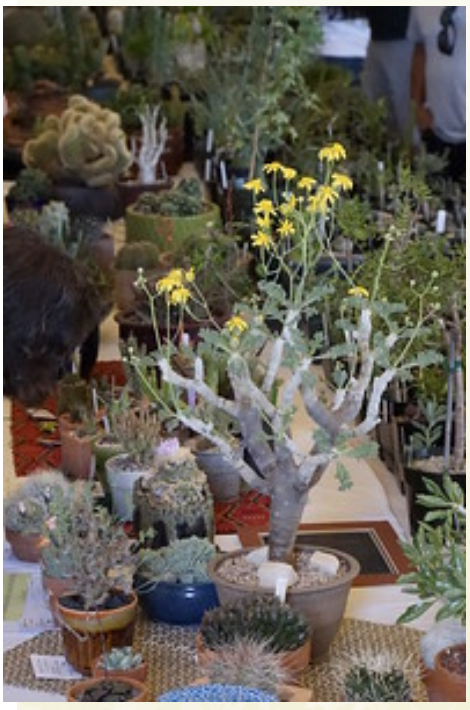
MBACSS Fall Sale Scene