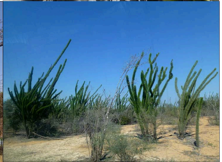
Didierea madagascariensis (Octopus Tree) Morombe, Madagascar