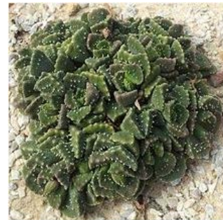
Photo: Lithops hookeri .

Aloinopsis species have a rather large tuberous root system, and they tend to grow more "heads" when they are raised. Most are winter growers and react badly to too much water at the wrong time.