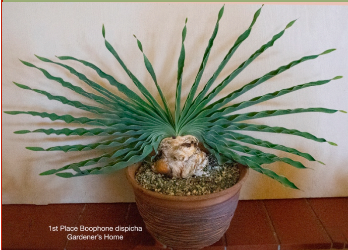
1st Place Boophone dispicha Gardener's Home