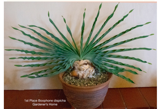
People's Choice Winner #1 Boophone dispicha by Gardener's Home