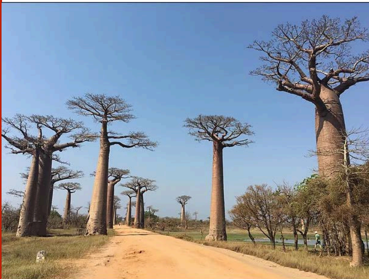
Adansonia grandidieri (Grandidier's baobab, giant baobab)