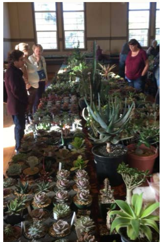
Show & Sale Scene

Veterans of Foreign Wars, Post 1716 1960 Freedom Blvd. Watsonville, CA