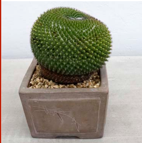
Cactus- Advanced Mammillaria sp.