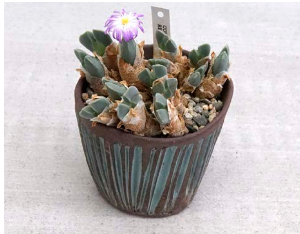
Succulent – Advanced Conophytum regale by Ellen Stubblefield