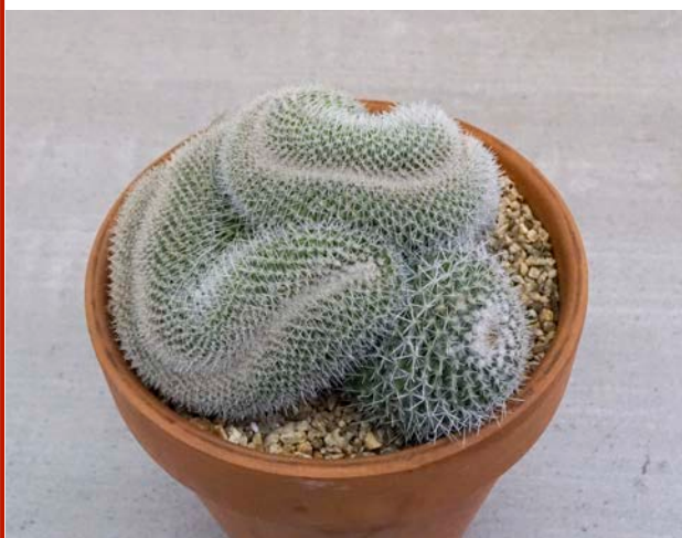
Cactus Intermediate Mammillaria nejapensis crest by Suzy Brooks