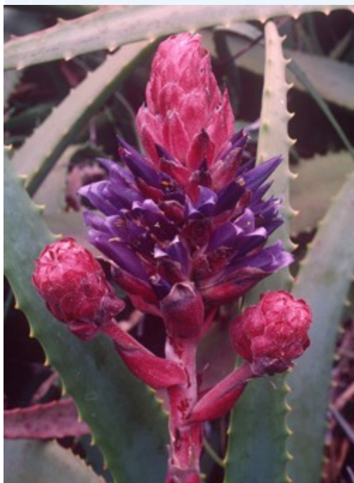
Flower of Puja venusta, at San Francisco Botanical Garden at Strybing Arboretum

Contact: Amber Burke < aburke1@ucsc.edu >