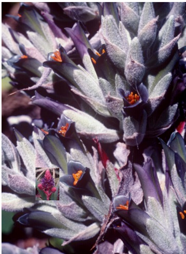
Puya aff. coerulea #2