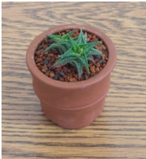
Aloe descoingsii