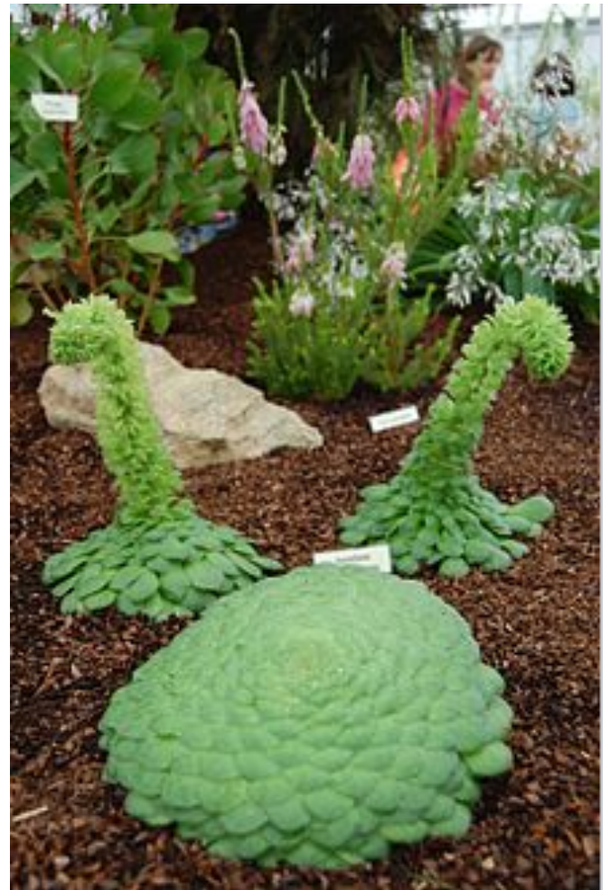
Three specimens of Aeonium tabuliforme , two with flower spikes

Low-growing Aeonium species are A. tabuliforme and A. smithii ; large species include A. arboreum , A. valverdense and A. holochrysum .