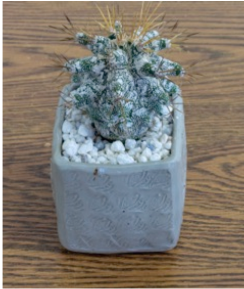
Aztekium (?) Cindy Trousdale