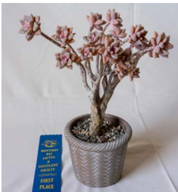
Graptopetalum by Gary Stubblefield 2019 Show Winner in Division III, Class 8.10