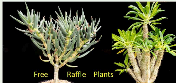
Free Raffle Plants Aloe ramosissima 2 gallon pot