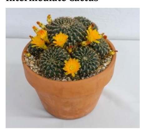
1. Sulcoreubutia arenacea Advanced Succulent