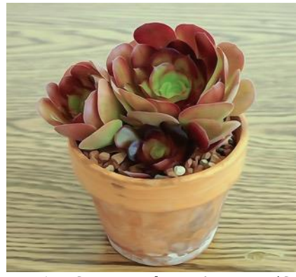
1. Suzy Brooks — Aeonium 'Garnet'