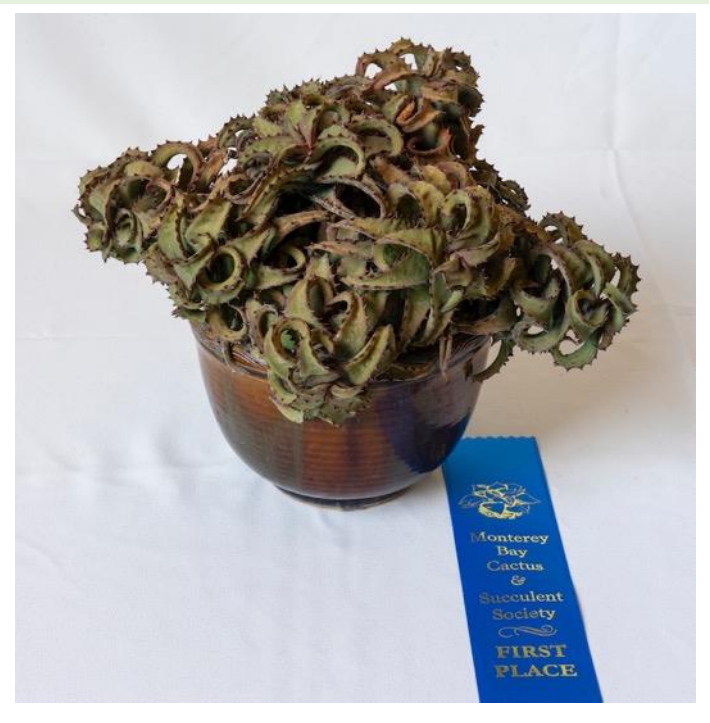
Naomi Bloss — Aloe castillione (Class II/3.1)