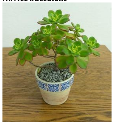
1. Joe Truskot — Aeonium 'Kiwi'