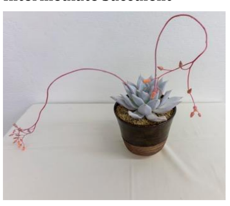
1. Echeveria colorata — Suzy Brooks Intermediate Cactus