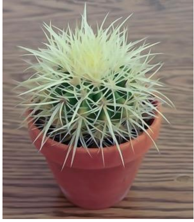
1. Suzy Brooks — Echinocactus grusonii