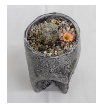
1. Rebutia Jemma Argibrite