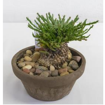
Euphorbia medusa by Mary Cross