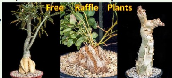
Adenium somalense 23" tall

Sorry, no credit cards no purchase necessary must be present