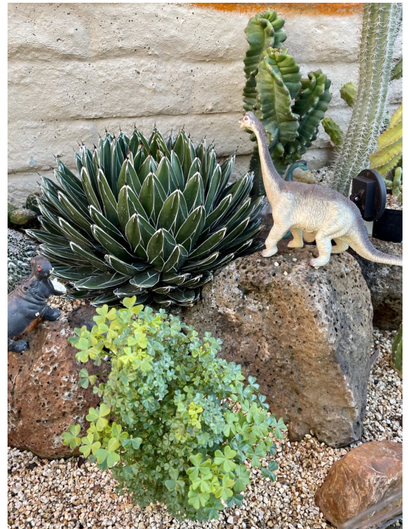
Dinosaurs in the cactus garden