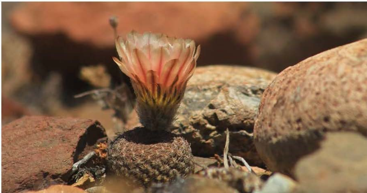
Eriosyce napina subsp. lembckei . A little cactus of Atacama Region that is a species in danger.