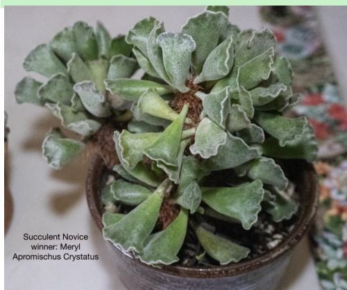
Succulent Novice winner: Meryl Apromischus Crystatus