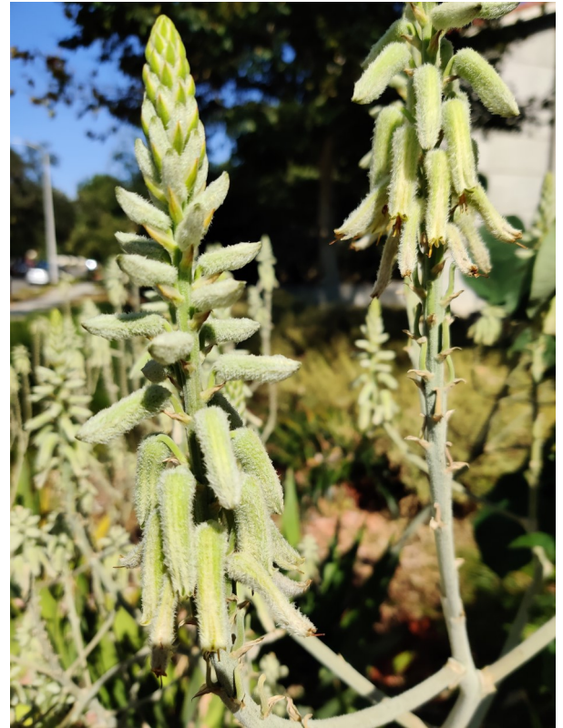
pic: Aloe tomentosa flowers