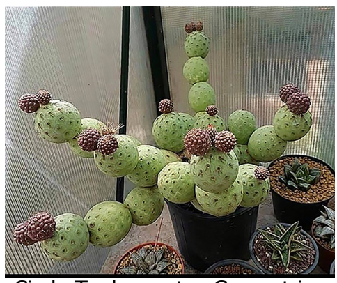
Circle Tephrocactus Geometricus